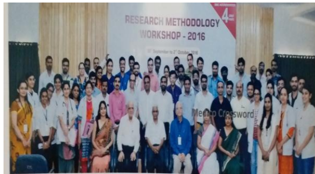
Research methodology workshop