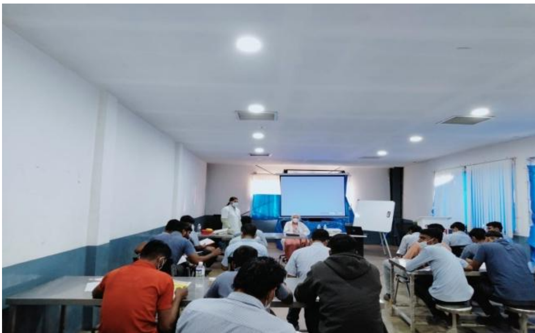
Training of COLS and First Aid on 14 th December for employees of Pitti

Engineering Pvt. Ltd. Waluj, MIDC, Aurangabad