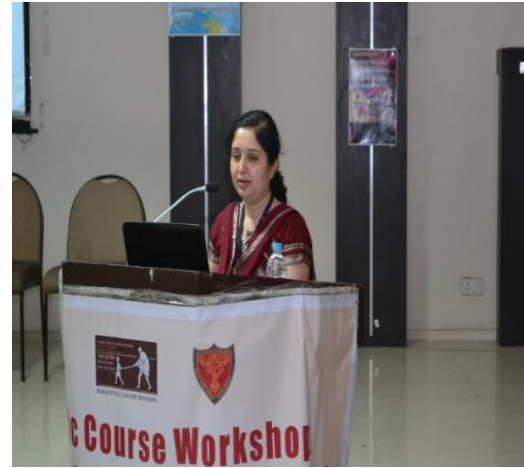
Basic MET workshops