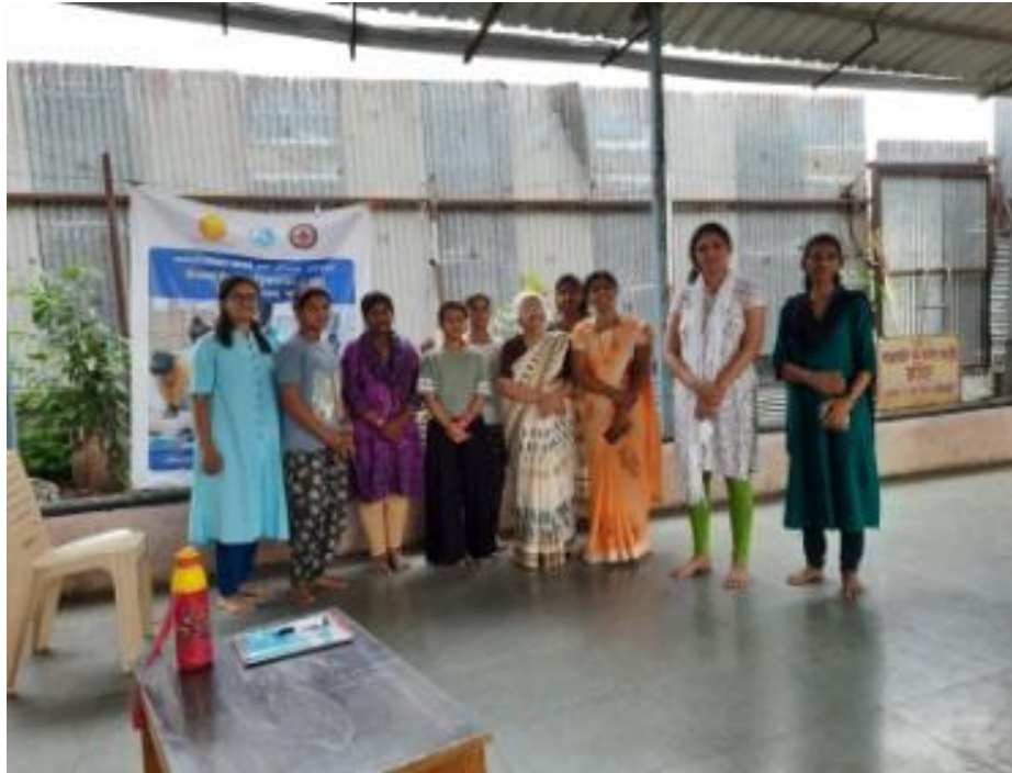
Training of COLS and First Aid for Bhagwan Baba Balikashrum, Satara arisar, Aurangabad on 7 th August 2022.