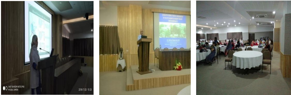
Student – Teacher activities