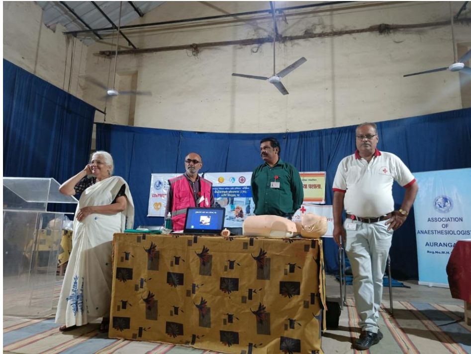
Training of COLS and First Aid for Sharda Mandir kanya Prashala Aurangabad on 26 th July 2022