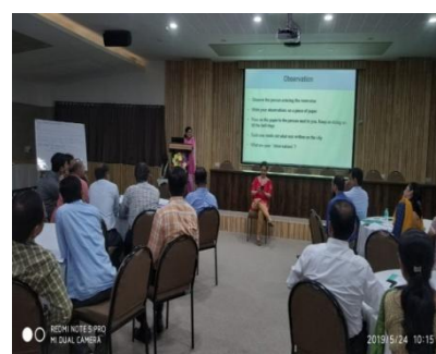
First CISP workshop