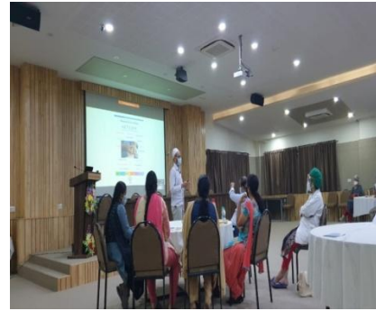
Online CISP 2