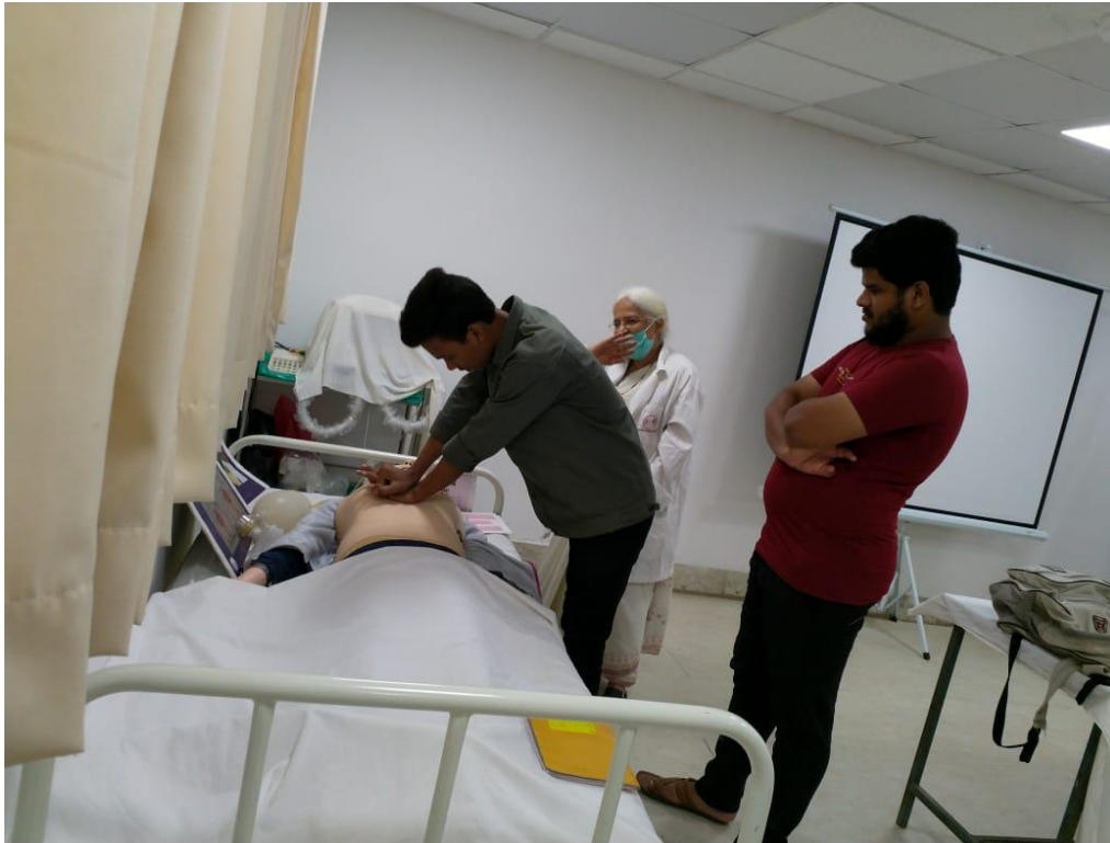
Skill Development Unit, Department of Emergency Medicine has conducted Training of BLS on 15 th June 2022 for Mangal Medi Center