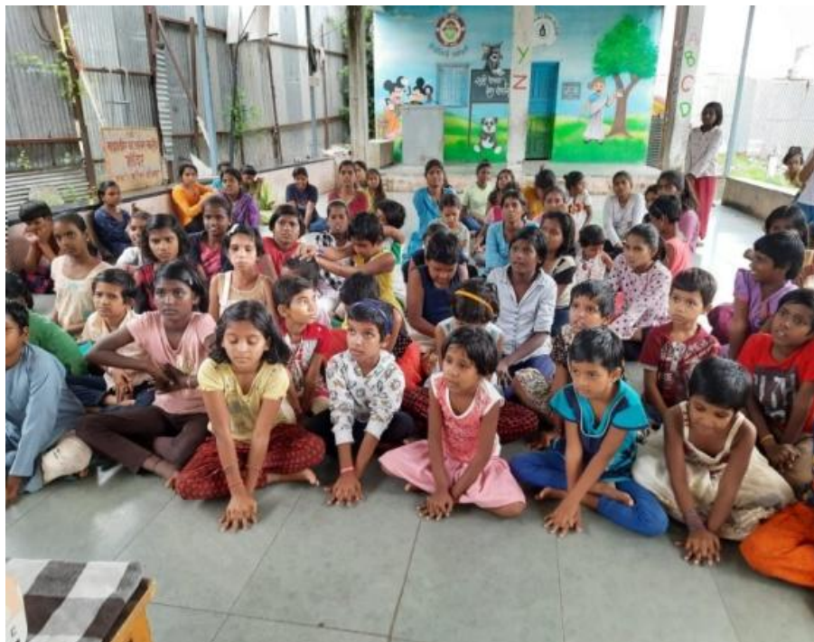
Training of COLS and First Aid for Bhagwan Baba Balikashrum, Satara Parisar, Aurangabad on 7 th August 2022.