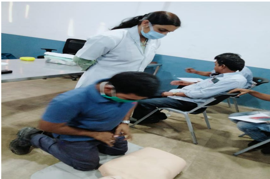
Training of COLS and First Aid on 14 th December for employees of Pitti Engineering Pvt. Ltd. Waluj, MIDC, Aurangabad