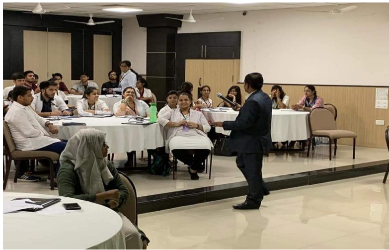
Communication skills course