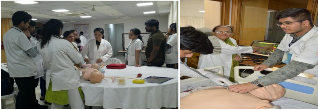
BLS & ACLS courses