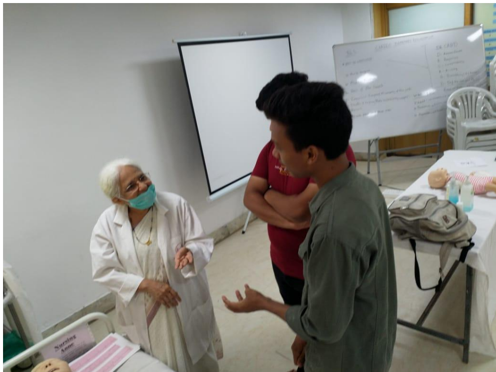
Skill Development Unit, Department of Emergency Medicine has conducted Training of BLS on 15 th June 2022 for Mangal Medi Center