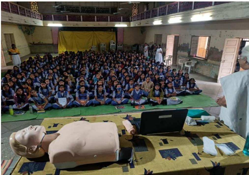
Training of COLS and First Aid for Sharda Mandir kanya Prashala Aurangabad on 26 th July 2022