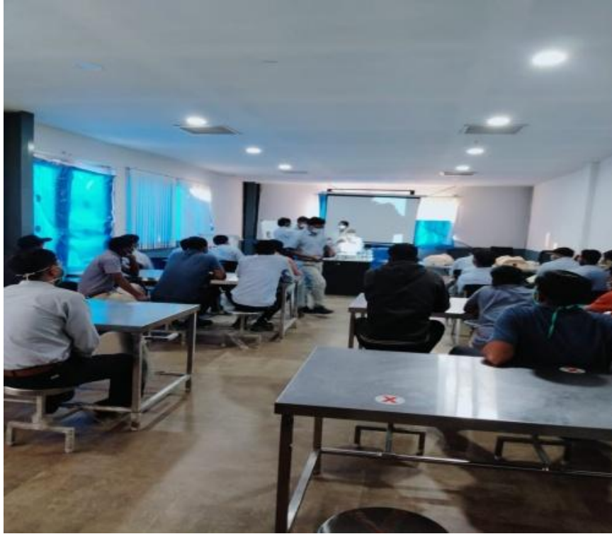
Training of COLS and First Aid on 14 th December for employees of Pitti Engineering Pvt. Ltd. Waluj, MIDC, Aurangabad