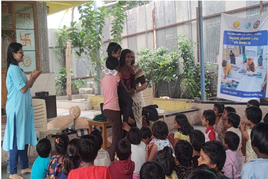
Training of COLS and First Aid for Bhagwan Baba Balikashrum, Satara Parisar, Aurangabad on 7 th August 2022