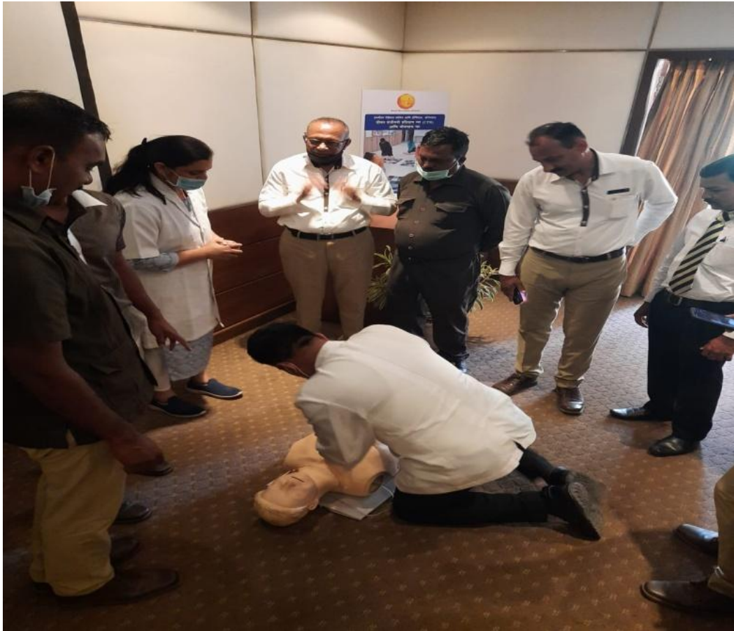
Training of BLS 11 th June 2022 between 12pm to 2 pm for staff members of Vivanta Taj Hotel, Aurangabad.