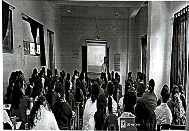
Session for BPT Semester I students on awareness regarding Internal complaint committee