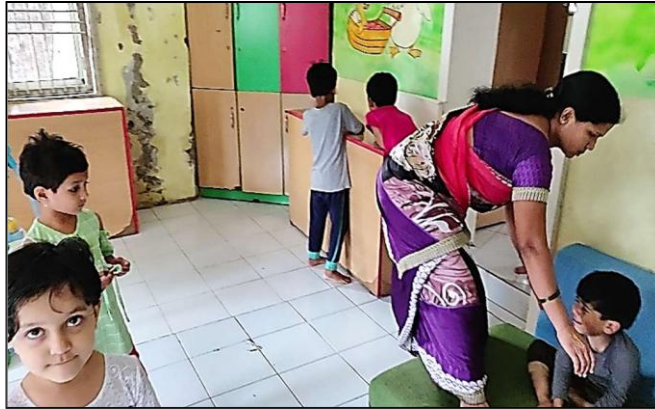
Day Care centre facility at Aurangabad