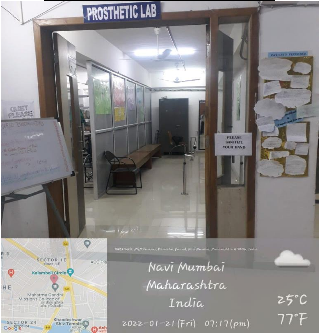
PIC-01 – PROSTHETIC WORKSHOP OUT SIDE VIEW AT MGMIUDPO